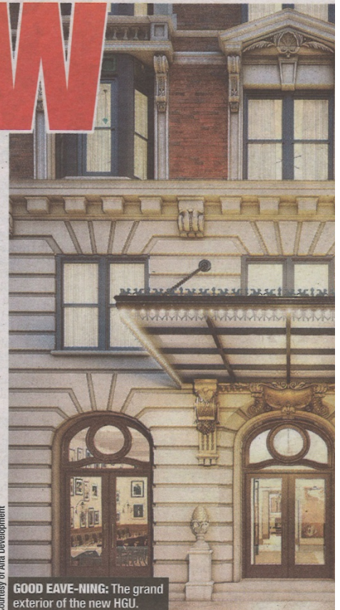
GOOD EAVE-NING: The grand exterior of the new HGU.

Nearby, the contemporary architecture of the June-opening William Vale (from $385; thewilliamvale.com ) is demanding attention. Its glass tower rises 21 stories on concrete trusses from a glass-walled single-story base, itself topped by a green-roof