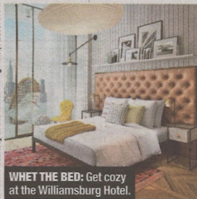
WHET THE BED: Get cozy at the Williamsburg Hotel.

That sultan of soigné interiors, Jeffrey Beers, has taken on design duties at Marriott's just-opened 348-room Renaissance Midtown (from $309; marriott.com ). Beers mixes high and low, placing polished marble, say, beside exposed cement. The hotel also combines traditional Marriott hospitality with a dose of the 21st-century, not least of all in interactive digital installations.