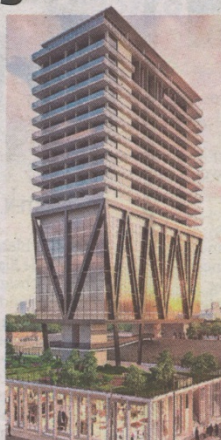
HEAD OF THE GLASS: The William Vale hotel cometh.

Opening this fall, meanwhile, SBE hospitality and entertainment group's much-delayed SLS Park Avenue (rates not yet available; slishotels.com ) comes to us from the fantastical imagination of French designer Philippe Starck. At this satellite of the party-ready brand — whose