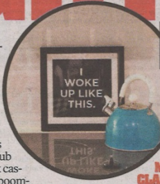
KETTLE TO THE METAL: Tea off at Riff.

brand's original property, in Chelsea, this wallet-friendly spot takes design inspiration from the '80s music and club scenes; think cassette-player boomboxes and Rubik's Cubes in every room, as well as the classic Atari and board games available for rent. Targeted to what it's calling "urban explorers," the