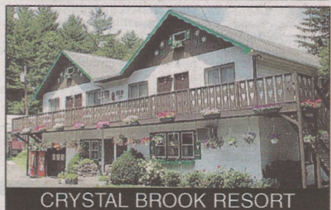
CRYSTAL BROOK RESORT